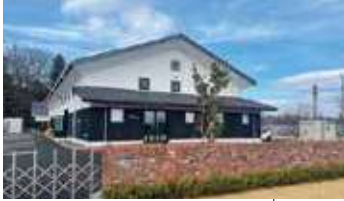
Kinsuisho Four Seasons Sake Brewery