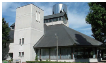
Yuji Koseki Memorial Museum