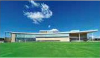
The Great East Japan Earthquake and Nuclear Disaster Memorial Museum