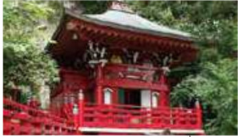
Nakano Fudosen Temple