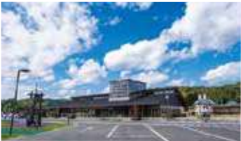
Iitate Roadside Station