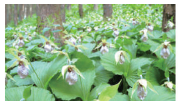
Mizuhara Japanese Lady's Slipper Colony