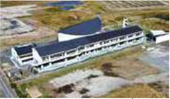
Ukedo Primary School