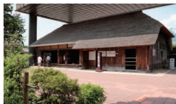
Hideyo Noguchi Memorial Museum