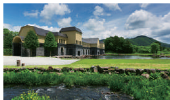
Morohashi Museum of Modern Art