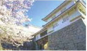
Kasumigajo Castle Park