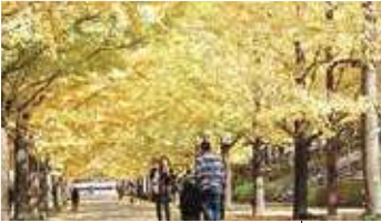
Azuma Sports Park