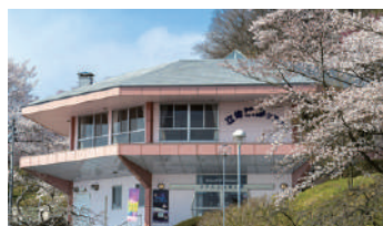
Iino UFO Museum