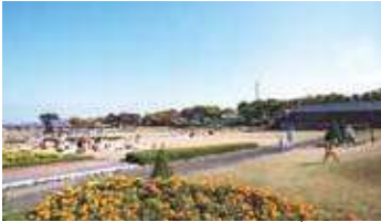
Shiki no Sato