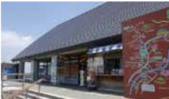
Tsuchiyu Roadside Station