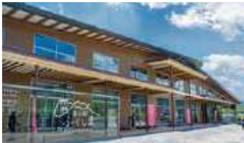
Fukushima Roadside Station